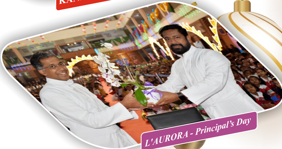
L'AURORA - Principal's Day