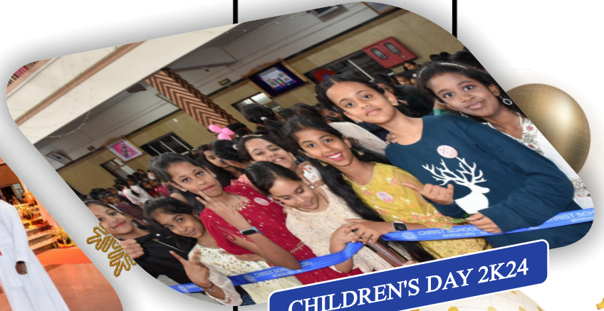
CHILDREN'S DAY 2K24